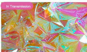
HR013 Red wrinkle effect /

Installation should be in accordance with manufacturer's installation instructions. Installed using the same methods for installing window films. Pls contact with us for instruction.